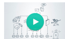
Business output - the next way

Submit your application/CV to job@multi-support.com . Take a look at multi-support.com and get a feel of the professionalism we communicate and deliver to our clients.